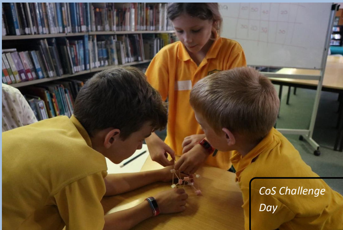
CoS Challenge Day